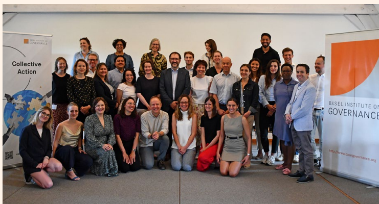
Participants at the Peer Learning Workshop, 28–29 June 2023, Basel, Switzerland.

The Basel Institute will continue to foster these dialogues which contribute to the wider community of practice relating to Collective Action with the next workshop set to take place in June 2025. This