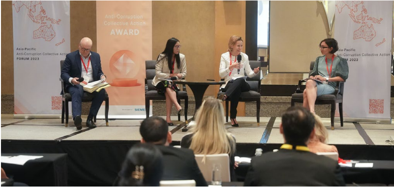
Asia-Pacific Anti-Corruption Collective Action Forum, Manila, the Philippines, 2023.