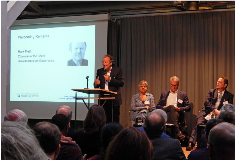
2nd International Anti-Corruption Collective Action Conference, Basel, Switzerland 2016.

The conference was a resounding success, propelling the mainstreaming of Collective Action. It demonstrated that multi-stakeholder initiatives are not just a theoretical concept but are already yielding tangible results in various sectors. This marked a significant shift towards evidence-based decision-making, ensuring that Collective Action efforts are scaled up using proven methodologies.