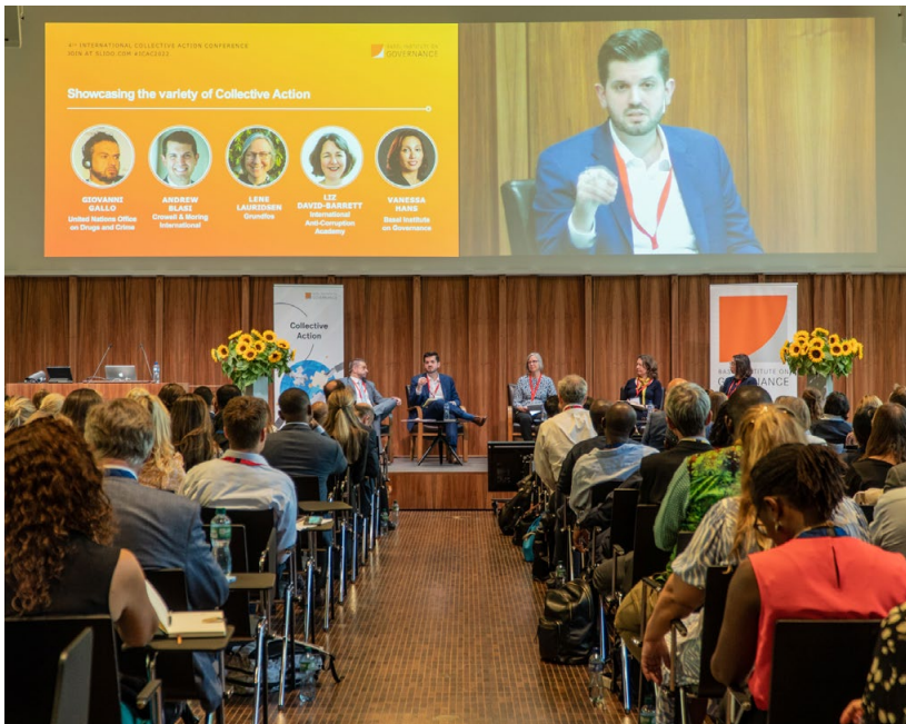
4th International Anti-Corruption Collective Action Conference, Basel, Switzerland, 2022.

The conference set up interactive workshops to give participants the chance to share experiences and lessons learned. Breakout sessions for the different stakeholder groups typically involved in Collective Action aimed at further carving out the respective stakeholder roles.