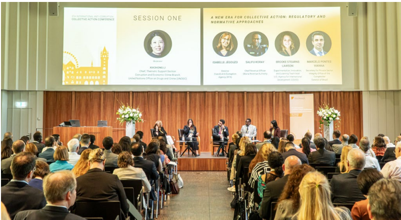
5th International Anti-Corruption Collective Action Conference, Basel, Switzerland, 2024.

A follow-up webinar in September 2024 continued discussions on how to integrate Collective Action into corporate compliance and risk management strategies.