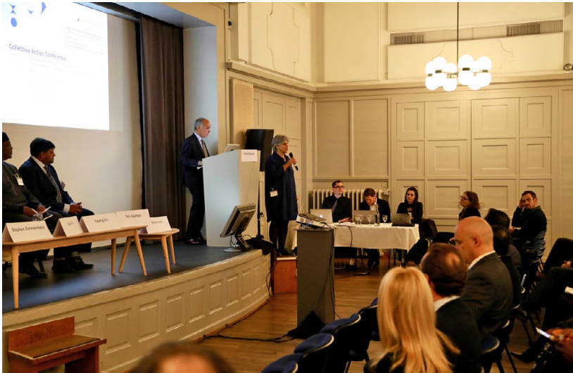
3rd International Anti-Corruption Collective Action Conference, Basel, Switzerland, 2018.

A key indicator of the conference's impact was the broadening of its audience. In addition to representatives from 95 businesses, we saw increased participation from law enforcement agencies, financial institutions and regulatory bodies. This reflected a growing recognition of Collective Action beyond the corporate compliance sector, reinforcing its relevance to public policy and global economic governance.