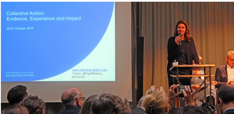
2nd International Anti-Corruption Collective Action Conference, Basel, Switzerland 2016.