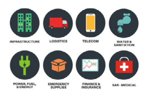
The PDRF cluster system divides member companies up according to their different business lines and skill sets. Image and more information: www.pdrf.org/emergency-operations-center/cluster-system/

amounts donated and where, allowing the operators to pinpoint locations still in need of support.