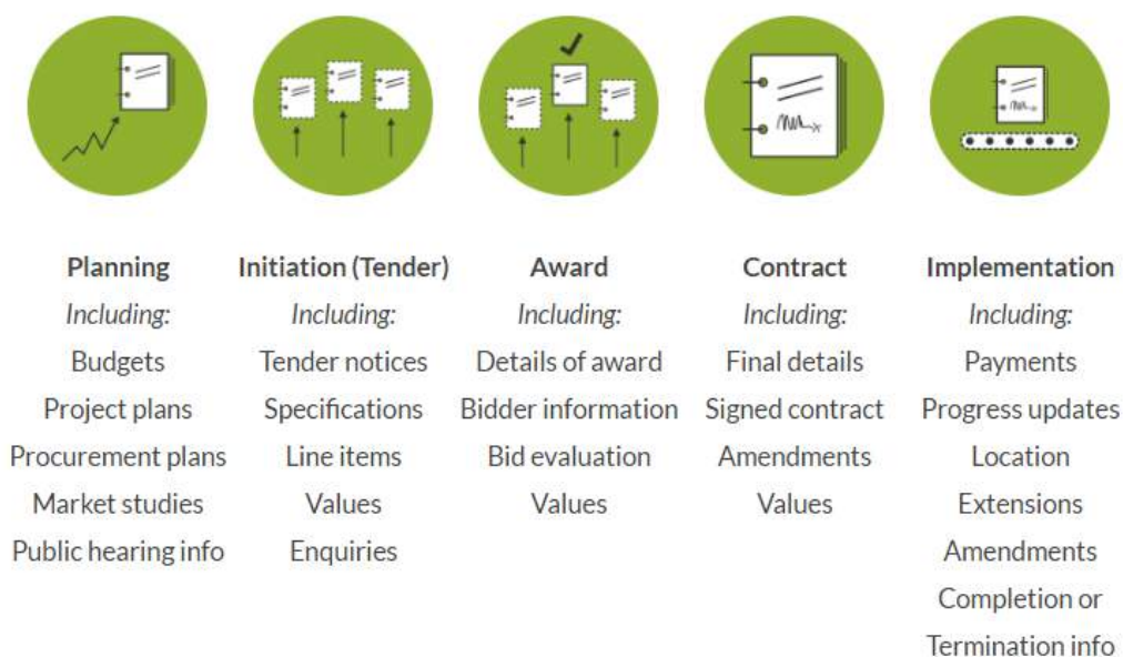
Figure 1: The contracting process