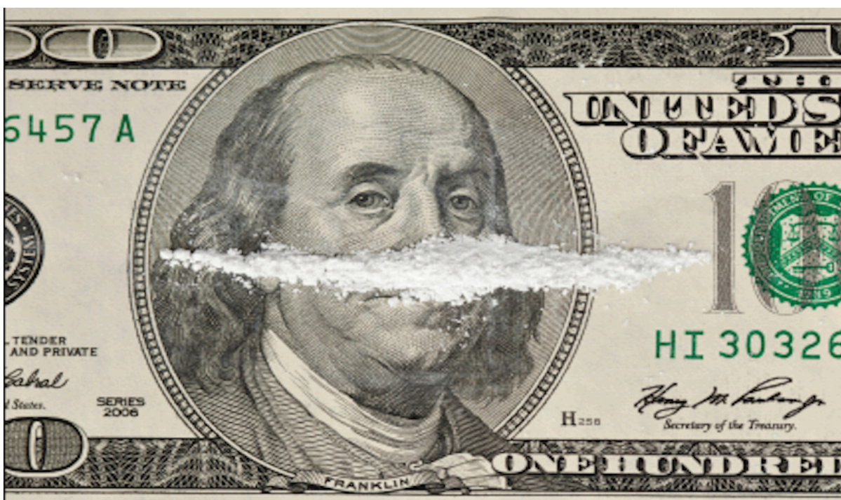
Figure 2 – Any given Bitcoin – like any used dollar bill – will probably have been involved in illegal activity at some point.

Take the most widely used cryptocurrency, Bitcoin, as an example. The great majority of bitcoins in circulation today have most likely been used in some sort of criminal activity in the past. They may have been used to purchase drugs and illegal goods on the darknet or otherwise involved in hacks, thefts or scams.